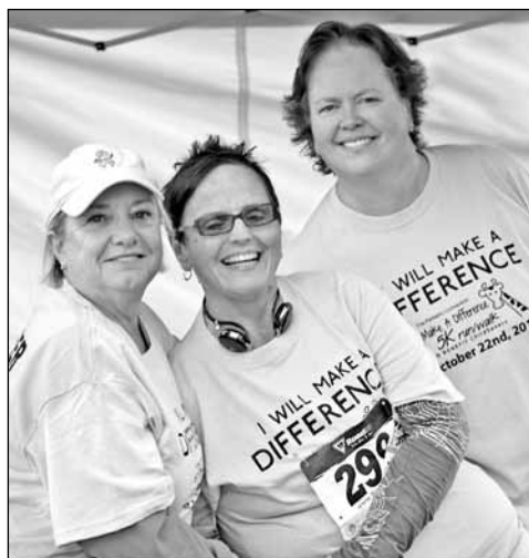
▲ Race day volunteers